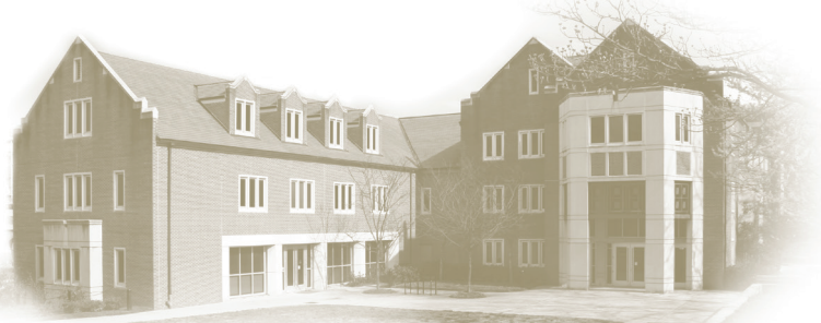
CLAXTON BUILDING HOME OF ICL

The Innovative Computing Laboratory (ICL) is a large Computer Science research and development group situated in the heart of the University of Tennessee's Knoxville campus. ICL's mission is to establish and maintain the University of Tennessee as a world leader in advanced scientific and high performance computing through research, education, and collaboration.